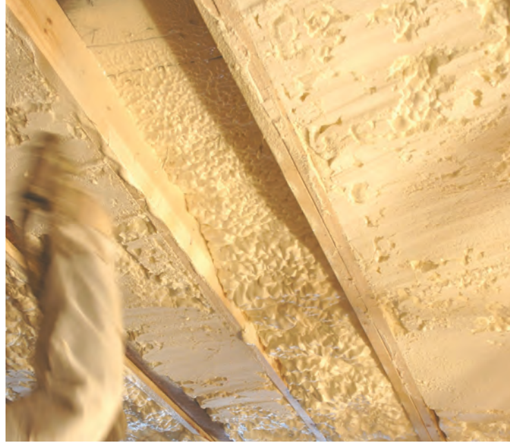
Icynene is installed in adherence with local building codes. Once applied, finished appearance may vary from photo shown.

Icynene's portfolio of insulation solutions is ideal for residential or commercial use. Let us provide you with a list of products and performance data to meet your needs.