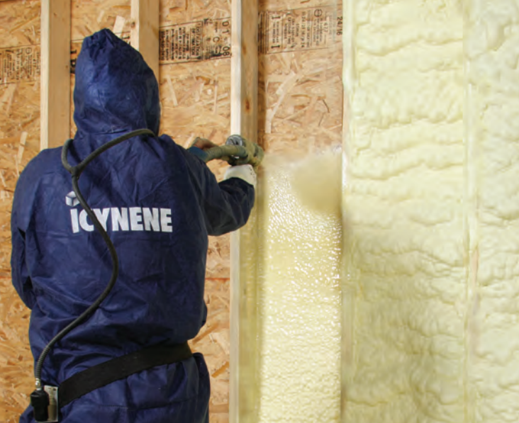
Icynene is installed in adherence with local building codes. Once applied, finished appearance may vary from photo shown.