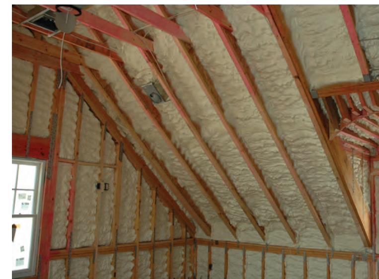
Icynene is installed in adherence with local building codes. Once applied, finished appearance may vary from photo shown.

For areas that require insulation with a lower vapor permeance, Icynene's Medium Density products are available. These products are ideal for use in areas with higher levels of humidity, such as crawlspaces, or where a higher R-value per inch is required.